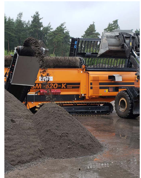
RemBind being used for PFAS soil remediation in Europe