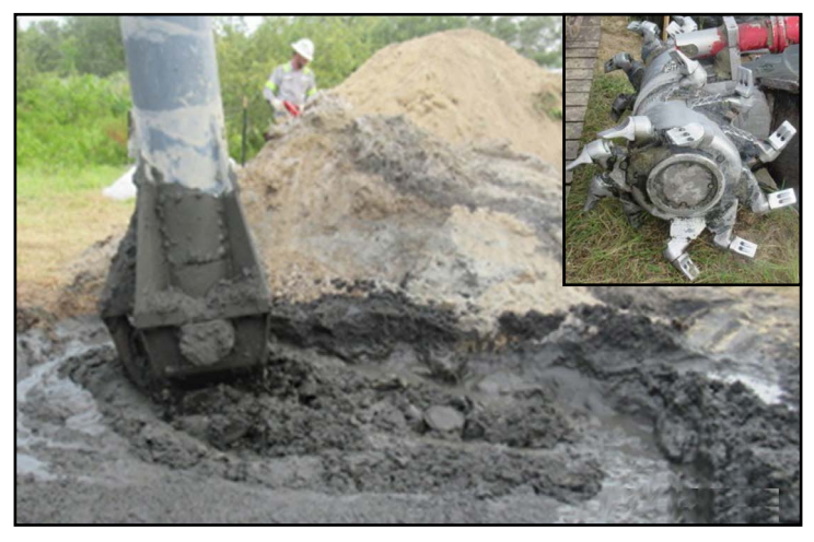
Adding RemBind and Portland cement to immobilise PFAS contaminants at a US field site

AquaBlok Ltd is the exclusive distributor for RemBind<sup>®</sup> products in North America.