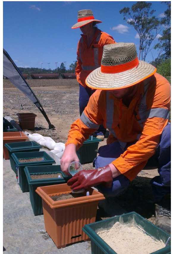
Pacific National setting up RemActiv trial