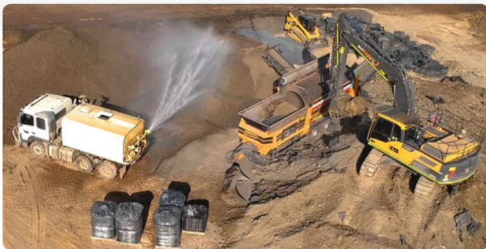
Soil Treatment Site

A mixing contractor was engaged to prepare the soil and thoroughly mix the RemBind ® using mobile trommel screens. The first part of the process involved mixing the RemBind ® with the contaminated soil using an excavator at an addition rate of 2%. Water sprays were used to suppress dust.