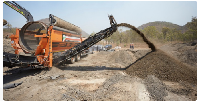
Soil Treatment Using a Mobile Trommel Screen

Because the landfill sits among natural creeks and wildlife, a special treatment area was prepared with a high level of environmental controls including a compacted clay liner and a clay bund to prevent leachate runoff. A water truck was used to control dust in the hot, windy conditions.